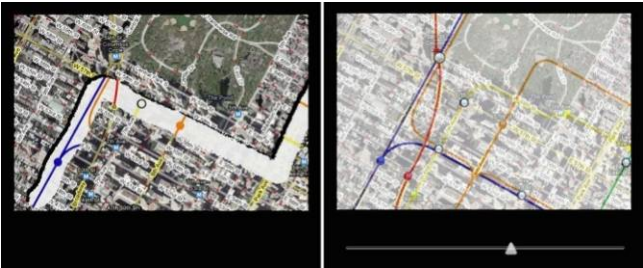
Figure 2. Our study compared scraping (left) with opacity fading using a slider (right).

We observed some interesting behaviors with the slider-based fading and scraping interfaces that informed the design of the formal study. When using the slider to fade through image layers, some users would hold their other hand over a point of interest to act as a visual placeholder. This led us to hypothesize that scraping has advantages over fading if the area being investigated has an arbitrary or large shape – not just a single point or line.