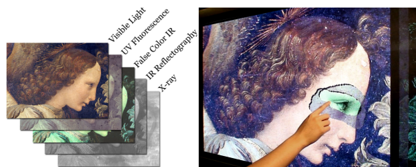
Figure 1. Multi-spectral scans of a painting (left); scraping through the layers of a painting using Wetpaint (right).

multiple layers of information, as when restoring a painting. By translating the physical act of scraping through layers into a touch interface on a large screen, it can be possible to make fast and accurate comparisons of multiple layers in an image. We introduce a system called Wetpaint that is based on the technique of scraping to provide an insight into the spatial and temporal relationship between multiple layers of an image.